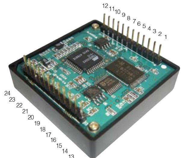
(45mm x 45mm x 18.5mm, 24 pin DIL package, 2.54 mm pitch)